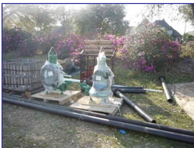
New submersible pumps wrapped from the factory and ready for installation into wet wells.