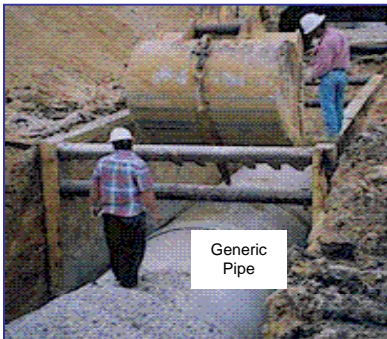
Collection system pipe sizes range from less than a foot to over six feet in diameter.

This project is primarily located north of Zachary with upgrades to the collection system near Baker included as part of that system upgrade. It is designed to alleviate chronic SSOs at the pump stations and increase the overall force main capacity.