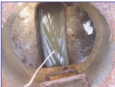
Flow measurements are taken throughout the collection system to determine the correct pipeline size.